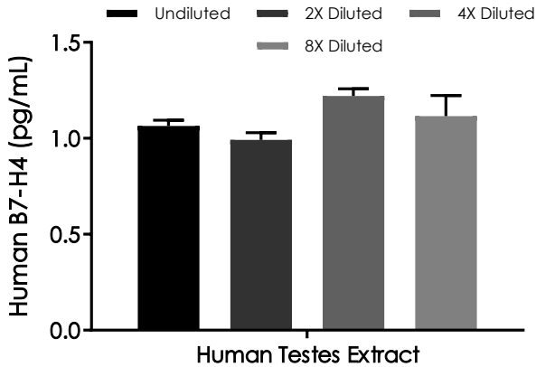
Figure 2. Interpolated concentrations of native B7-H4 in human testes extract. The concentrations of B7-H4 were measured in duplicates, interpolated from the B7-H4 standard curves and corrected for sample dilution. Undiluted samples are as follows: Human testes extract 45 \mu\text{g/mL} . The interpolated dilution factor corrected values are plotted (mean \pm SD, n=2 ). The mean B7-H4 concentration was determined to be 1,098 pg/mL.