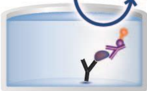
Substrate Colored Product

Add the substrate solution BCIP/NBT to each well and monitor spot formation.